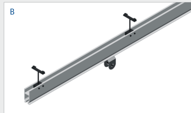
A. Aluminum bridge on ceiling mounted aluminum runway