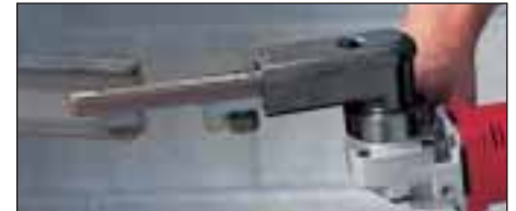
Grind and deburr ends of metal stock.