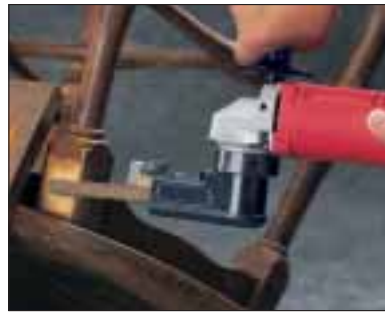
Effective in sanding hard to reach places on wood and other non-metallic surfaces.