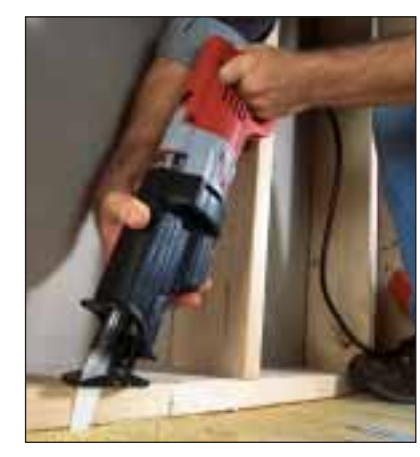
Ideal for plunge cutting, pipe cutting and demolition into metal, wood, fiberglass, cast iron and many other materials.