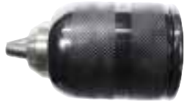
48-66-1575 Lok-Tor® Chuck Knurled Sleeve Provides A Comfortable, Durable Gripping Area

100% All-Metal Chuck For Ultimate Durability And Performance