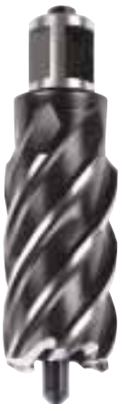
EJECTOR PIN SOLD SEPARATELY

25 sizes available. From 1/2" to 2" diameter hole sizes, 2" depth.