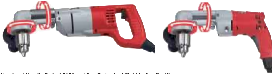
Head and Handle Swivel 360° and Can Be Locked Tight in Any Position.