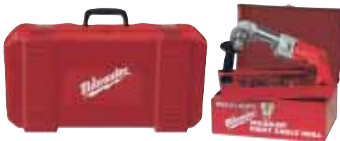
CARRYING CASES 48-55-0802 Impact resistant carrying case for "D" Handle drills 48-55-0200 20 gauge steel for Magnum® drill 3300-1.