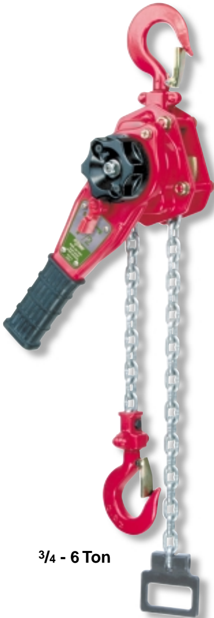
3/4 - 6 Ton

The industry's easiest-to-operate ratchet lever hoist just got better -- Little Mule LMSC Models are available with optional LOAD LIMITERS. Also featuring through-hardened load chain, these stamped steel ratchet lever hoists are lightweight, durable and are ideal for construction and commercial applications. All LMSC hoists are metric rated.