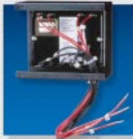
Electronic Acceleration Control