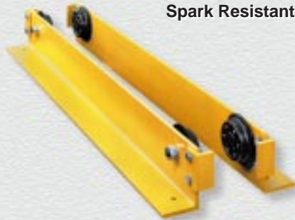
Underhung Angle-Type End Truck Capacities to 2 Tons Spans to 30 Feet

All Coffing Crane Components Meet All CMAA Specifications and Adhere to Rigid Design and Quality Specifications Spark Resistant Components Available For All Models