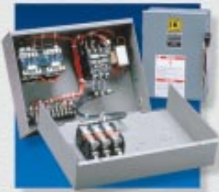
NEMA Control Panels