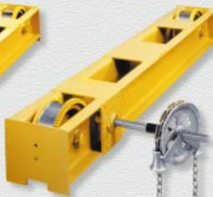
Top-Running Hand Geared End Truck Capacities to 5 Tons Spans to 36 Feet