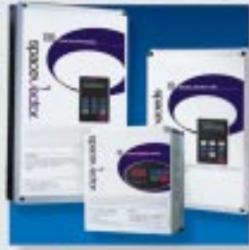
Space Vector™ Variable Frequency Drives