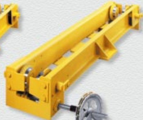
Underhung Hand Geared End Truck Capacities to 5 Tons Spans to 36 Feet