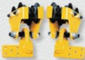
Underhung Clevis-Type Capacities to 1 Ton Spans to 25 Feet