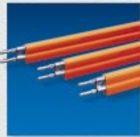
Shielded Bar Conductors