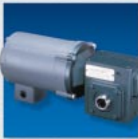
Special Drive Motors and Reducers