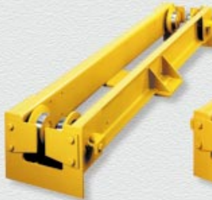
Underhung Push-Type End Truck Capacities to 5 Tons Spans to 36 Feet