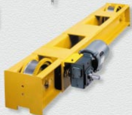
Top-Running Motorized End Truck Capacities to 5 Tons Spans to 36 Feet

* Top-Running Trucks Have Cast Iron Wheels