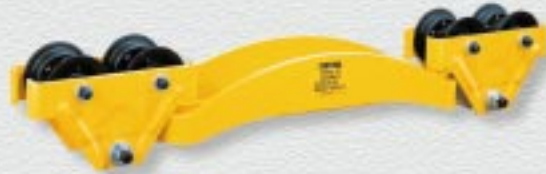
Underhung Carriage-Type End Truck Capacities to 3 Tons Spans to 30 Feet