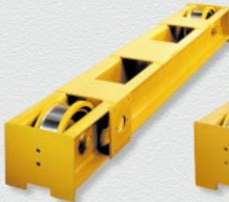
Top-Running Push-Type End Truck Capacities to 5 Tons Spans to 36 Feet