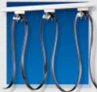
Track Suspended Festooning