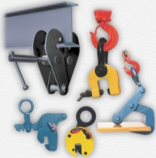
PLATE CLAMPS are special devices commonly used below-the-hook to efficiently move sheets of material or beams. A wide variety of models are available to fit the particular material handling task.

Ideal for rigging operations as a temporary or permanent anchoring point, COFFING BEAM CLAMPS range in capacities from 1 to 10 tons and flange adjustments from 3 to 12.6 inches, depending on the model. The clamping jaws are specifically designed to distribute the load away from the flange edge.