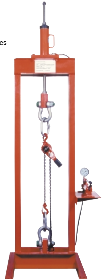
12 Ton Test Stand Order Product Code 1200