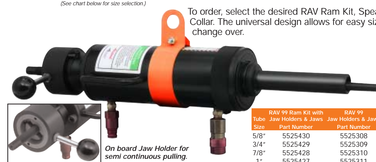
On board Jaw Holder for semi continuous pulling.

To order, select the desired RAV Ram Kit, Spear, and Collar. The universal design allows for easy size change over.