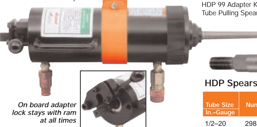
On board adapter lock stays with ram at all times

HDP 99 Ram Kit (5525280) includes: 2900118 HTP 99 Ram 5525283 HDP 99 ALA Adapter Lock Assembly 2900007 HDP 99 LC 1 QC 1" Load Cap