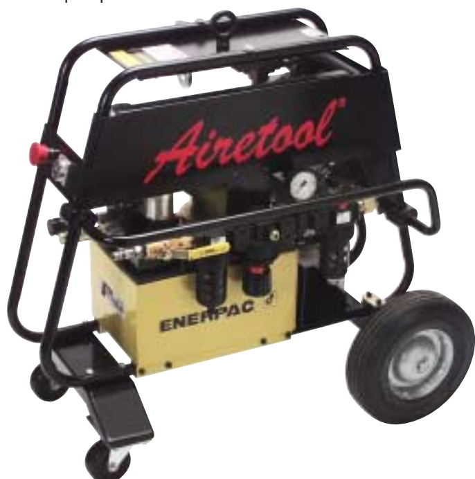
ATP-9400-B Electric Hydraulic Pump Unit Requires HDP-HC-15B Hose Cord Assembly w/Pendant (5525505) when operating HDP / HDQ / RAV 99 Rams.