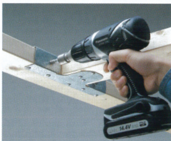
Screwing into metal sheet