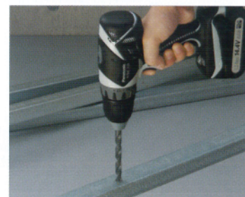
Drilling into metal sheet