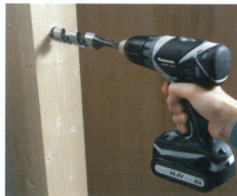
Drilling into wood