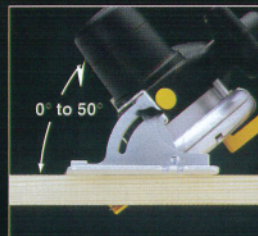
Bevel adjustment to 50°