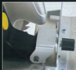
Slotted upper blade guard for easy blade visibility