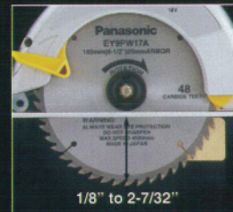
Depth of cut adjustment 1/8" to 2-7/32"