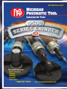
9500 Series Grinders