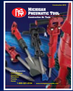
Construction Air Tools