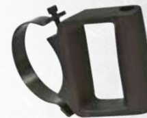
#2080-A48 Optional Dead Handle