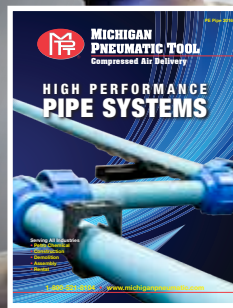
Compressed Air Pipe Systems