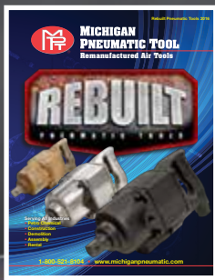
Rebuilt Pneumatic Tools Flyer