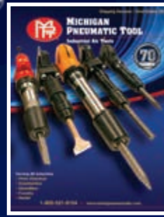
Chipping Hammer & Rivet Busters