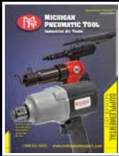
Supplemental Tool Catalog