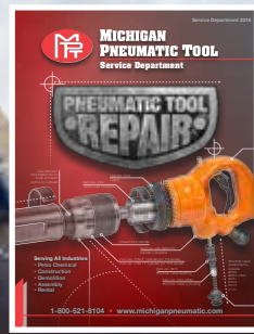
Pneumatic Tool Repair