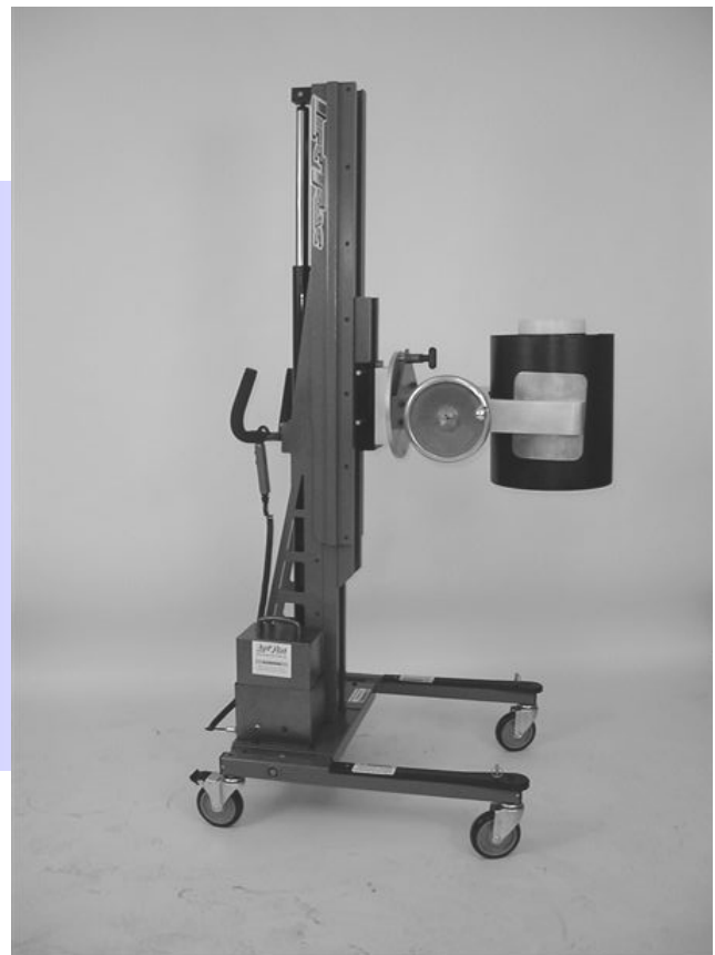
LIFTTRAC 2500 WITH MANUAL LINEAR SLIDE CLAMP MANIPULATOR