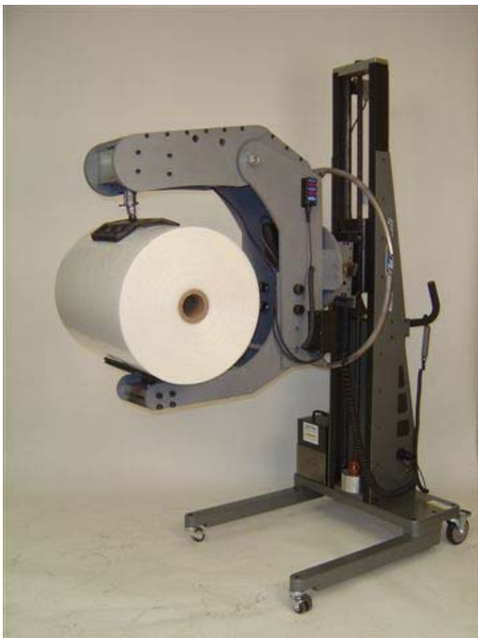
LIFTTRAC 5000 WITH CLAMSHELL ROLL MANIPULATOR