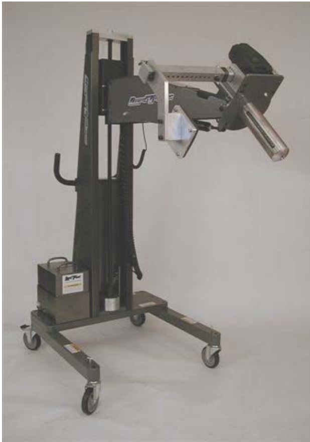
LIFTTRAC 5000 WITH ANTI- TELESCOPING ROLL MANIPULATOR