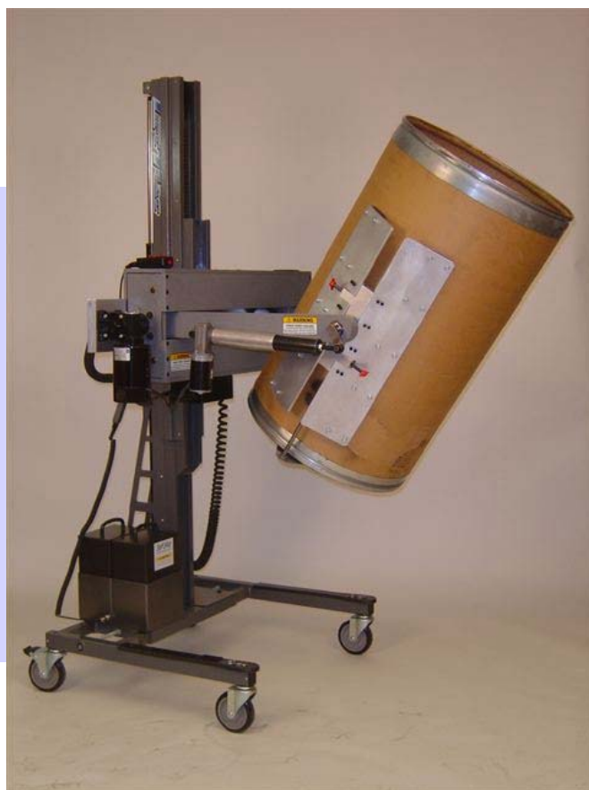
LIFTTRAC 2500 WITH LINEAR SLIDE BARREL MANIPULATOR