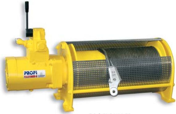
PROFI PULLER 6600-6 with wire rope* and drum guard**