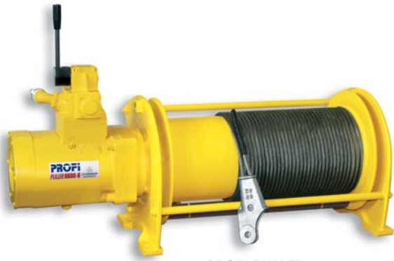
PROFI PULLER 6600-6 with wire rope*