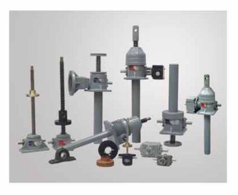
SCREW JACKS (MECHANICAL ACTUATORS)