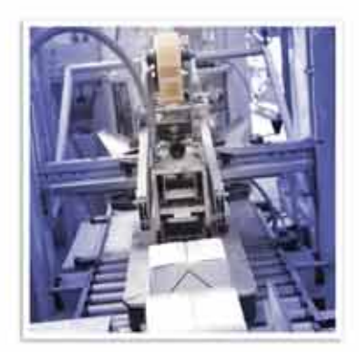
Aluminum & Steel • Paper • Communications • Entertainment Food & Beverage • Plastics • Rubber • Packaging Industrial Machinery • Transportation