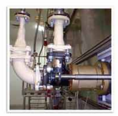
Aluminum & Steel Manufacturing • Can Manufacturing Energy • Food • Paper • Plastics • Printing Rubber • Textiles