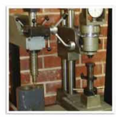
Automation • Machine Tool • Aluminum & Steel • Paper Entertainment • Food & Beverage • Plastics • Rubber Packaging • Transportation