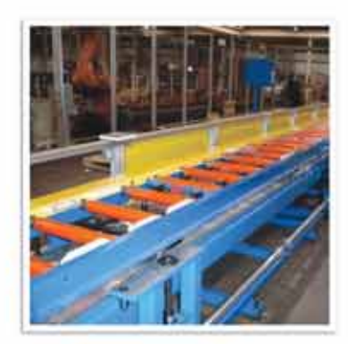
Aluminum & Steel • Communications • Entertainment Food & Beverage • Industrial Machinery • Packaging Paper • Plastics • Rubber • Transportation